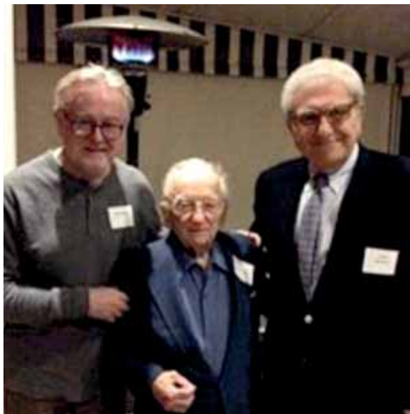
From left to right: William A. Schabas, Benjamin B. Ferencz, M. Cherif Bassiouni

the way to a more humane and peaceful world bound by the rule of law. No one should ask for more.