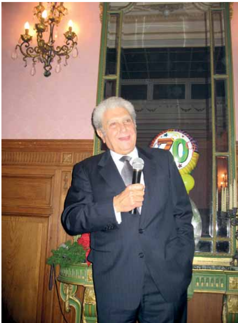
On the occasion of his 70 anniversary at Grand Hotel Villa Politi, Siracusa