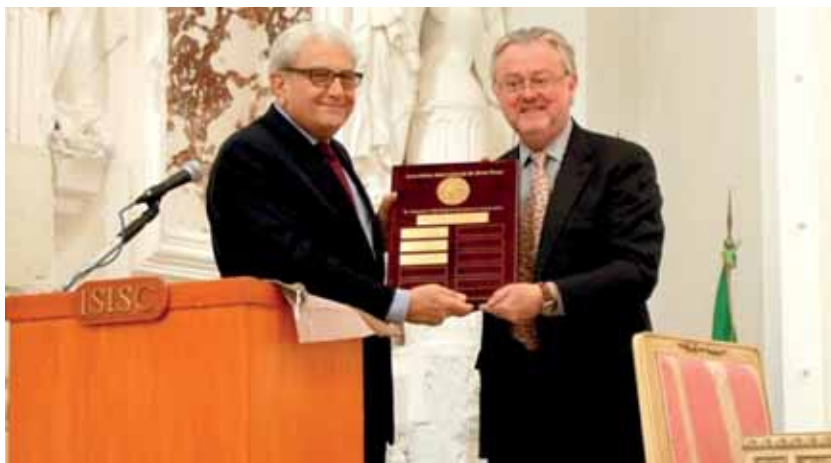
M.C. Bassiouni and William A. Schabas

Cherif Bassiouni, the global hero, had many dimensions. A brief note cannot aspire to describe them all. His friends and admirers will continue to communicate Cherif's huge legacy and to share his infectious enthusiasm. But even when our voices are stilled, his writings will endure. His name will resonate for generations of scholars, activists and campaigners for principles of international law, the laws of humanity, and the requirements of the public conscience.