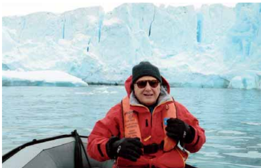
South Pole 2013