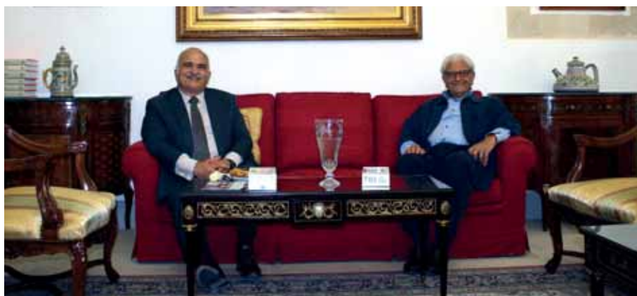
Prince El Hassan Bin Talal and M.C. Bassiouni

He was a sincere friend who was always ready to discuss our mutual longing for respect for the other, whomsoever and wheresoever they may be. It is with fondness I recall those conversations over the years on subjects of common and mutual interest – peace and justice for all.