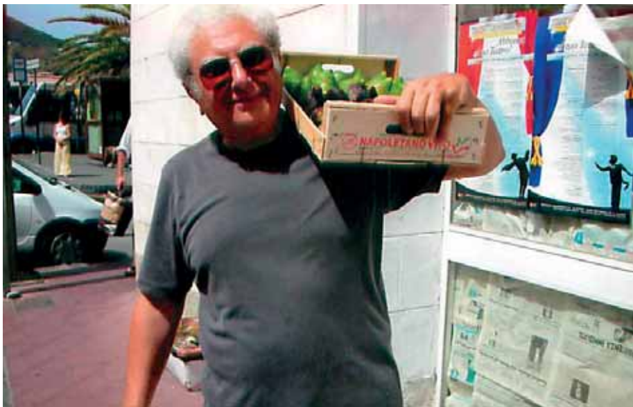
Aeolian Islands 2006